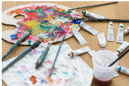
Art / Friday / 2 pm