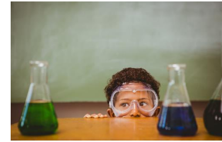
Science / Tuesday / 9 am