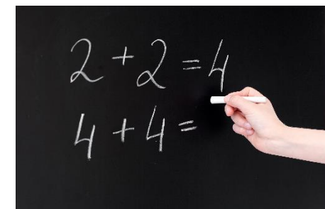
Math / Wednesday / 2 pm