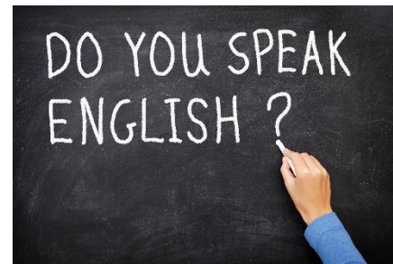
English / Monday / 10 am