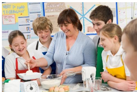
Home Economics / Thursday / 11 am