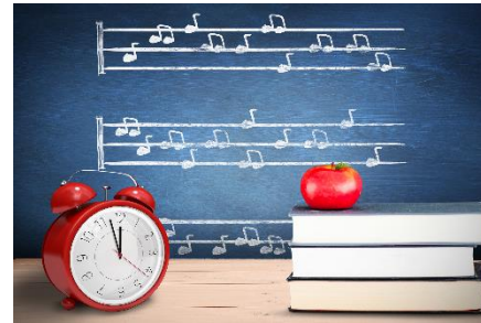
Music / Wednesday / 3 pm