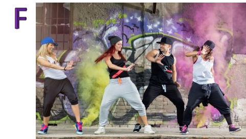
The students / Friday evening