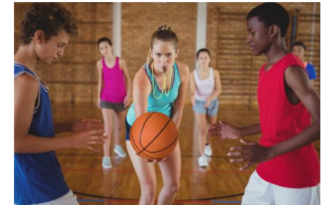
PE / Friday / 10 am