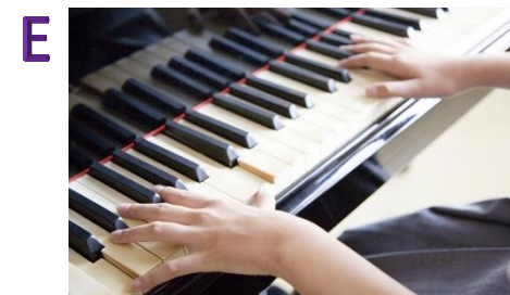
Kana / 11 am