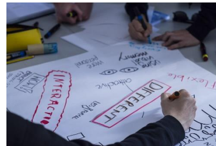
Social Studies / Friday / 9 am