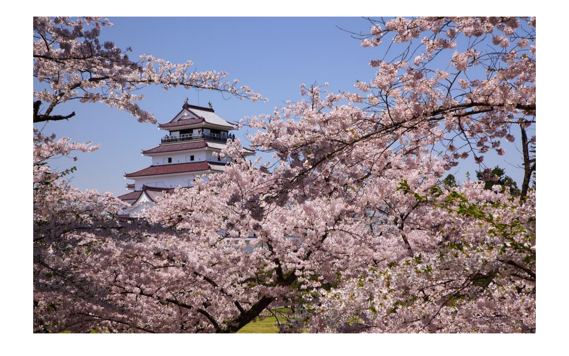
My Spring Vacation