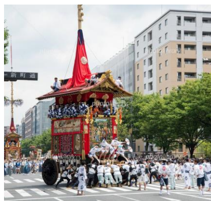
祇園祭 (Gion Festival) Kyoto, July