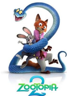
Zootopia2 Dec 5 2025